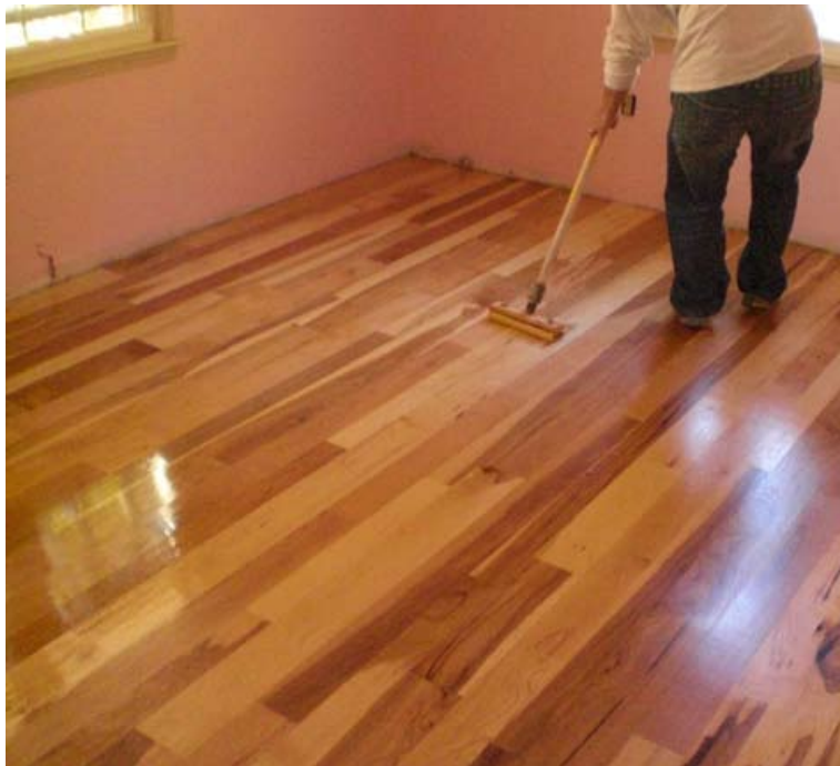
Below: Foam Applicator Replacement Pad Gets wrapped around wooden mop as shown on left.

Customer support: orders@earthpaint.net , www.earthpaint.net , 828-258-2580